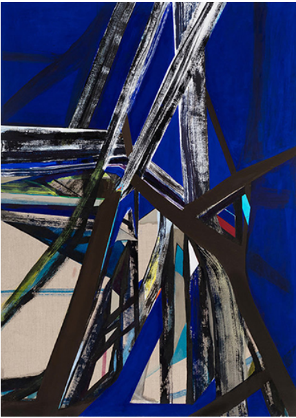
Laura Newman, Ghost Ship, 2015. Acrylic, ink and Flashe on linen, 60 x 43 inches.