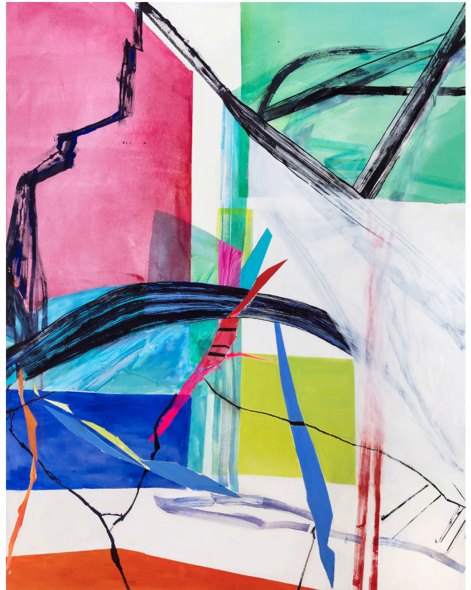
Veil , 2018, oil, acrylic and ink on canvas, 72 x 56"