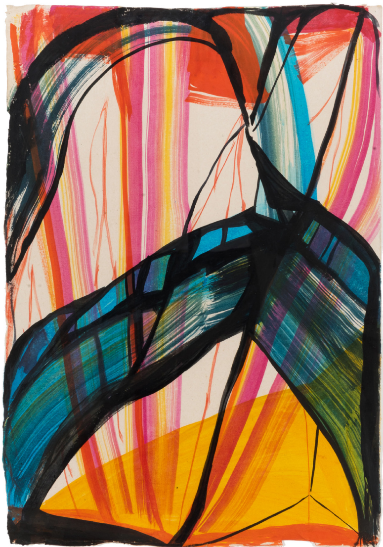
New Year, 2016, acrylic, ink and watercolor on handmade wasli paper, 22 x 15"