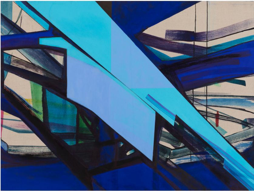
Slice , 2017, flashe, ink and acrylic on linen, 30 x 40"