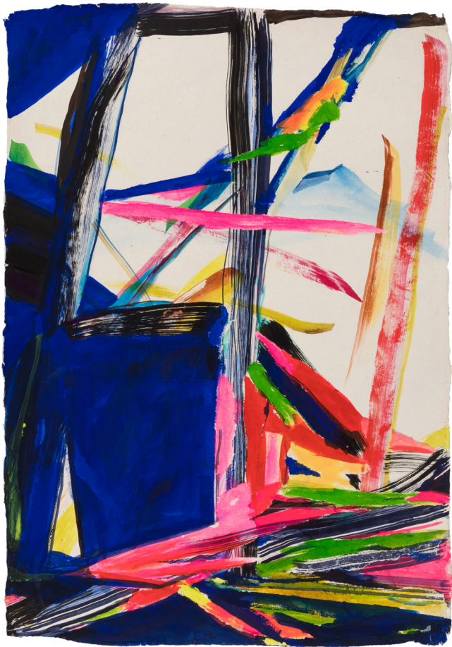
Rome Window , 2017, acrylic, ink and flashe on handmade wasli paper, 30 x 22"