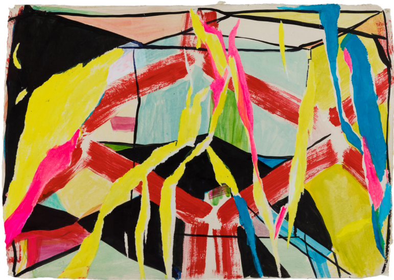
Burn , 2017, acrylic, ink and flashe on handmade wasli paper, 22 x 30"