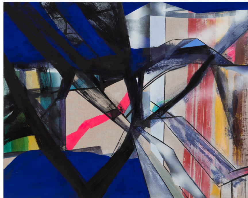
Night Walk , 2018, flashe, ink, spray paint and acrylic on linen, 24 x 30"