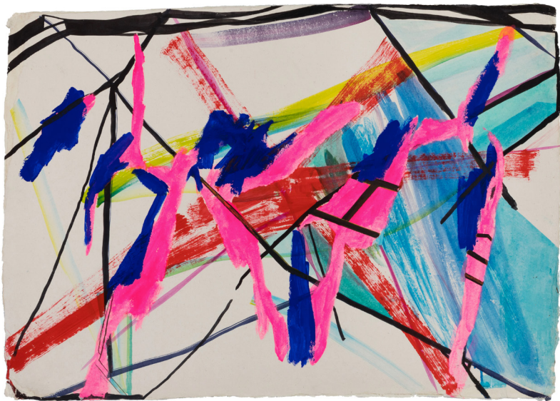
Tatter I , 2017, acrylic, ink and flashe on handmade wasli paper, 22 x 30"