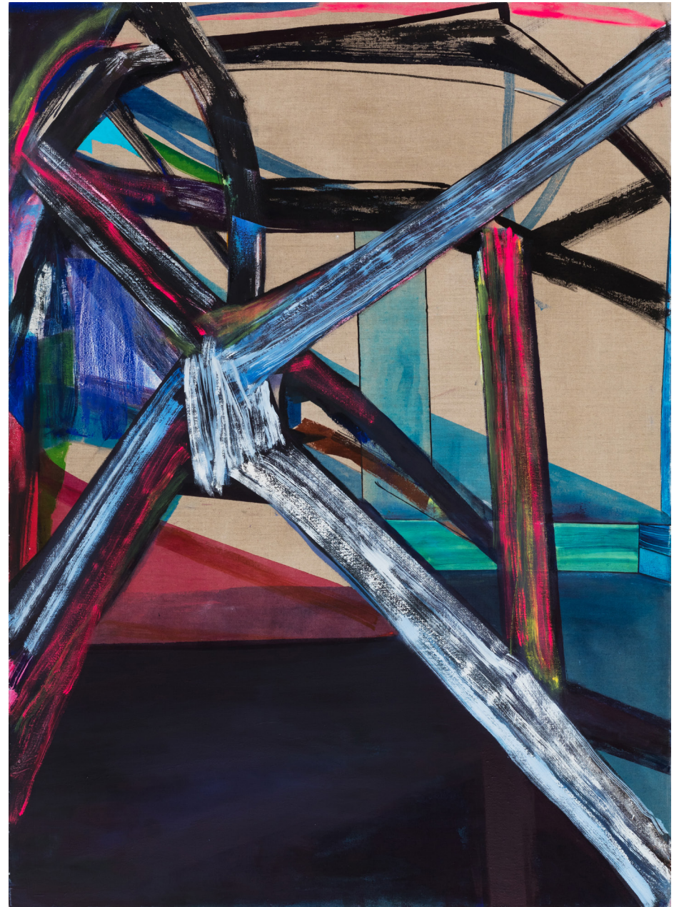
Camera , 2017, acrylic, ink and oil on linen, 60 x 50"