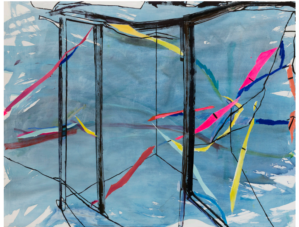
Reach , 2018, acrylic, ink and flashe on canvas, 54 x 60"