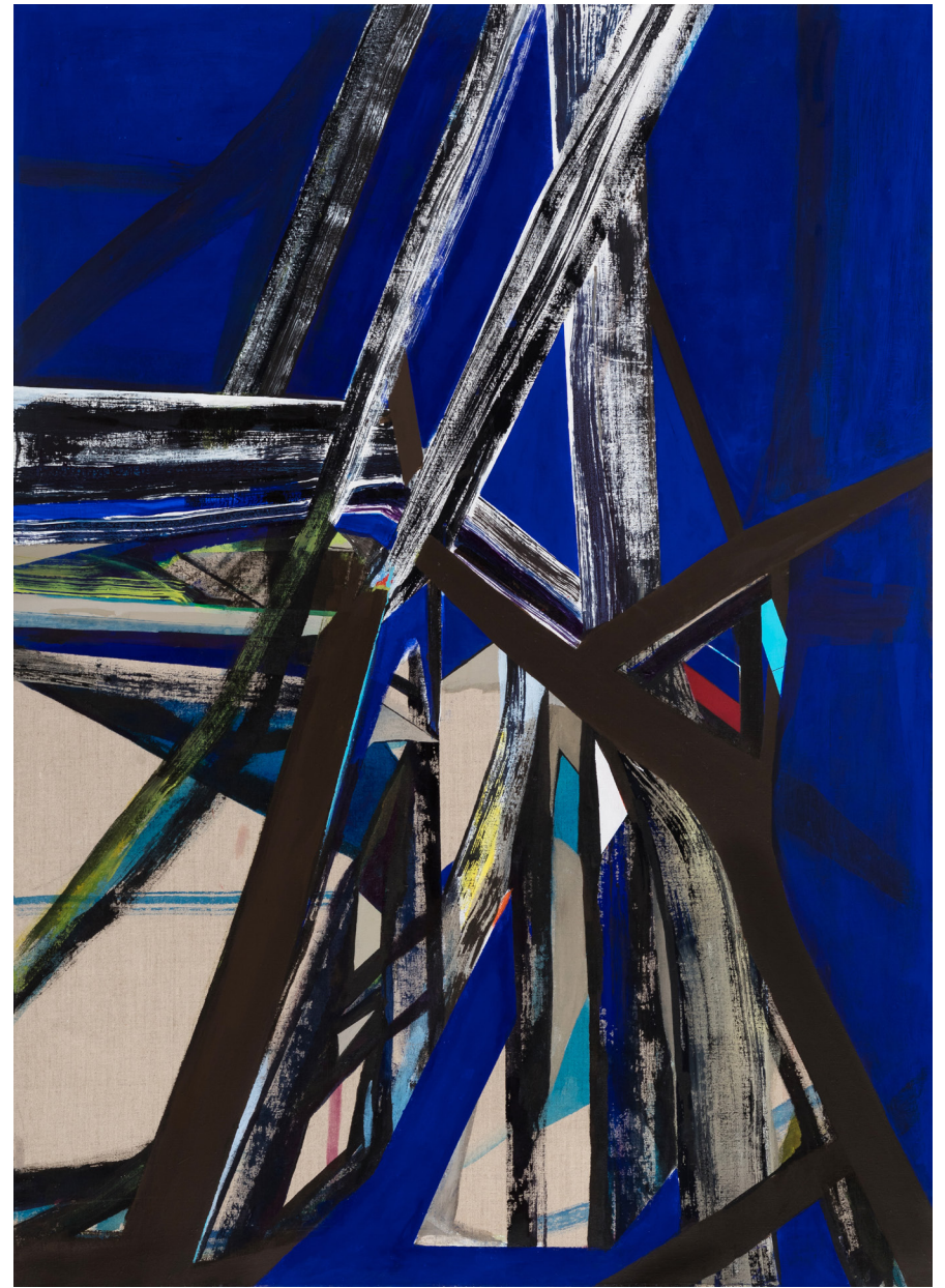
Ghost Ship , 2015, acrylic, ink and flashe on linen, 60 x 48"