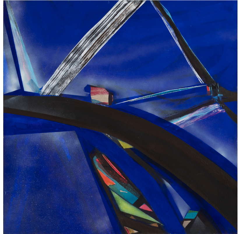
Sideral , 2017, flashe, ink, spray paint and acrylic on linen, 30 x 30"